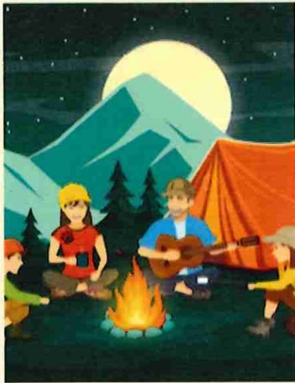
Camp Out Night

FEATURING: GUIDING GOOD CHOICES FAMILY PROGRAM